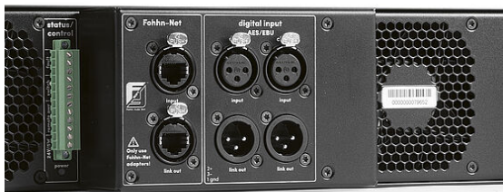
Input interface AES/EBU XLR