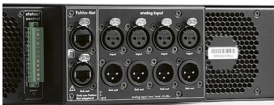
Input interface analog XLR