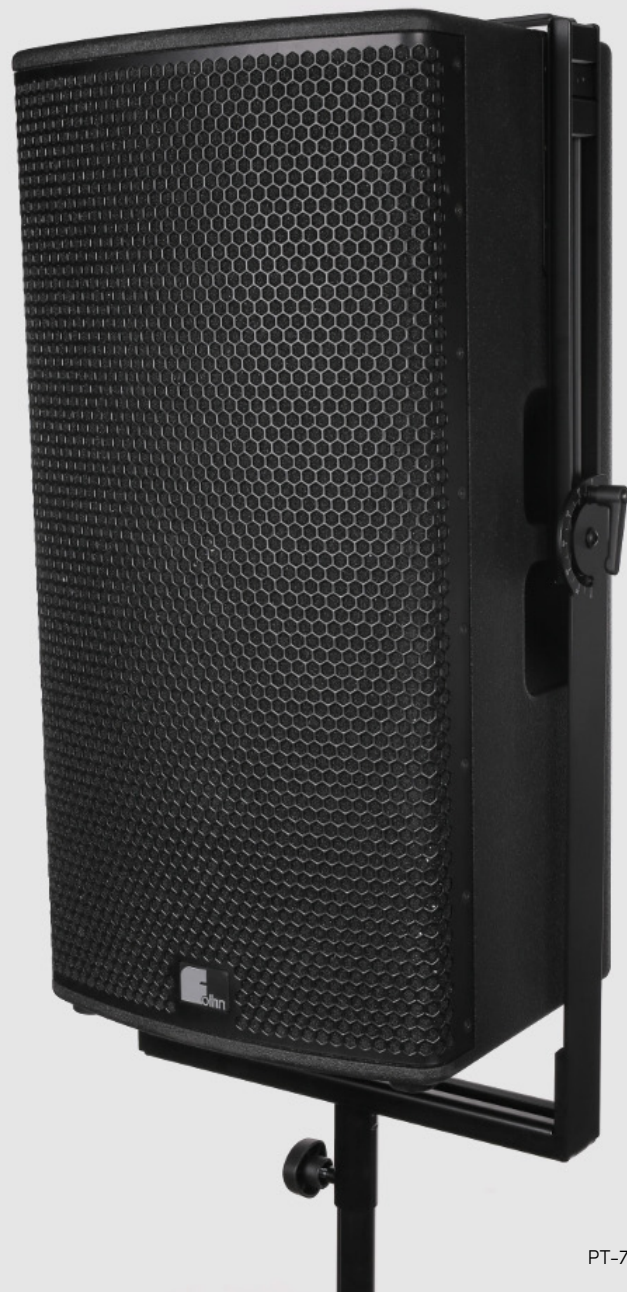
PT-70 in tripod use with universal bracket VPT-70

If you have further questions, or would like some more information on our PERFORM-SERIES product, please visit our website or contact us directly: