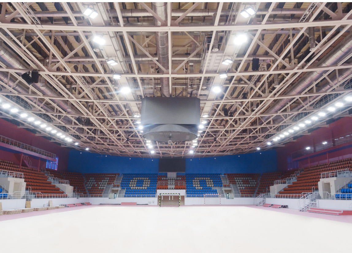
After the conversion: the new home of HK Motor, Zaporizhia.

Motor Sich Sports Complex, Zaporizhia, Ukraine