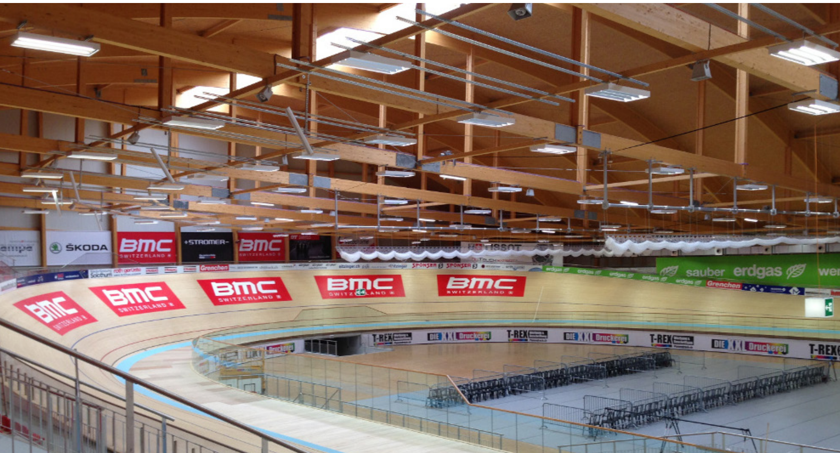
Flexible choice of sound reinforcement zones using the FR-10 remote control module.

High levels of speech intelligibility: Linea Focus systems with Fohhn Beam Steering Technology.