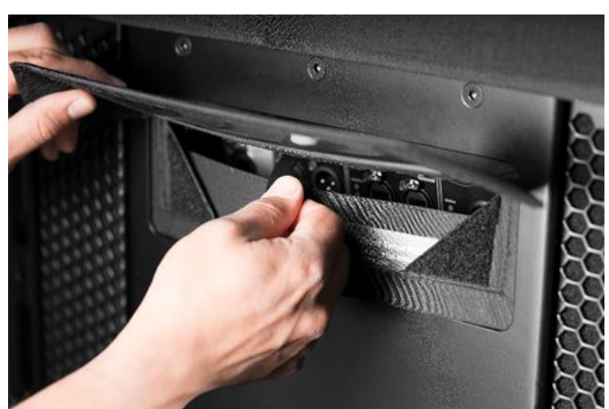
Transport: Open the hook and loop fasteners and flatten the lid against the housing.