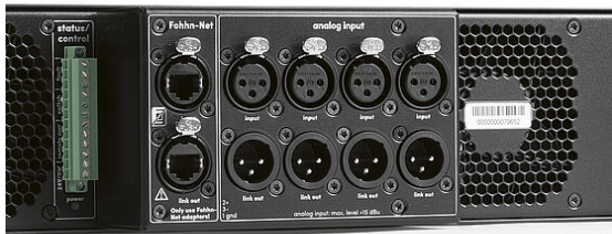
Input interface analog XLR